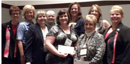
Chapter presidents or delegates accepting the award for their Chapter's Award for Excellence with the Incoming International President and NW District Director.

From 1:30 p.m. to 2:30 p.m. on Sunday was the Districts Caucuses. This is the one opportunity during the annual meeting for members from each district to network, communicate and share information. You also meet the candidates from your respective districts. The Trust's District Awards and Chapters of Excellence Awards are presented. Our Headquarters Executive Director and International President also stopped by for a short question and answer session.