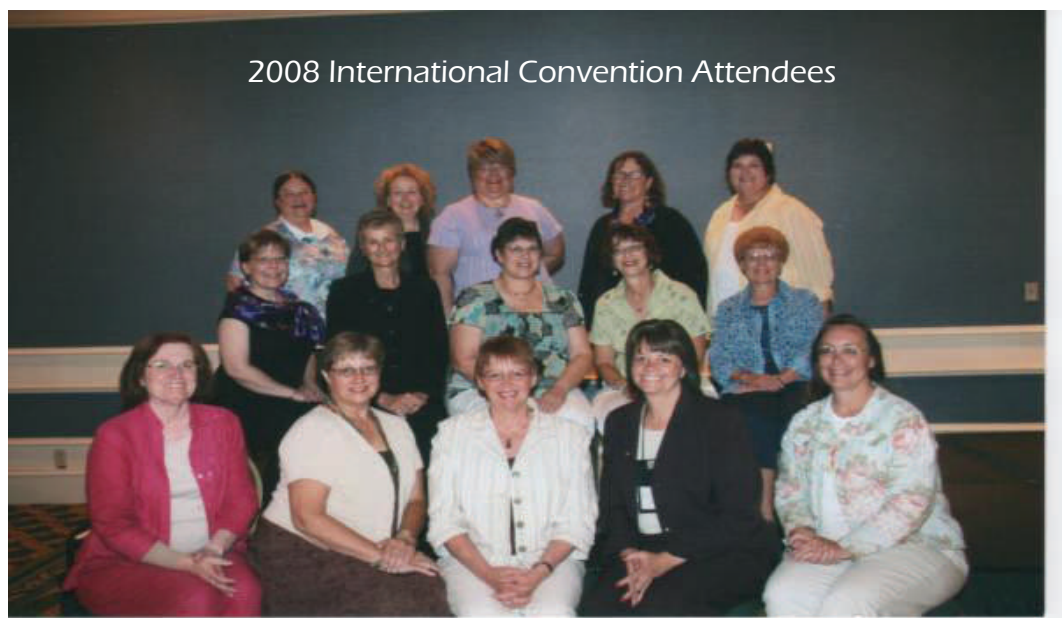
2008 International Convention Attendees