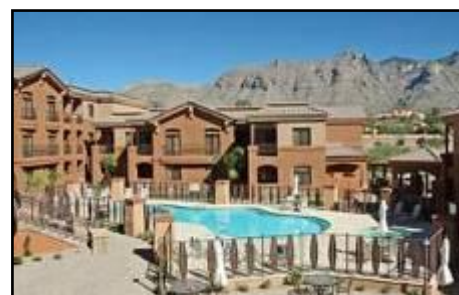
Embassy Suites – Paloma Village DEFAM Host Site

The DEFAM is open to all NTS Chapter members.