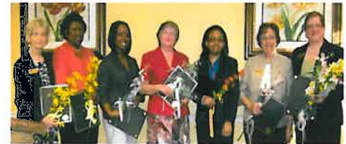
2011-2012 Atlanta Chapter Board of Directors