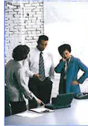
IAAP provides resources to meet needs and challenges facing administrative staff, today and tomorrow.

IAAP can become your partner in leading your administrative professionals toward achieving excellence. We provide resources to meet the needs and challenges facing the administrative staff, today and tomorrow. IAAP members receive the tools and knowledge necessary to become more effective contributors to their employers. By reading IAAP publications and attending IAAP educational events, members stay on top of their profession.