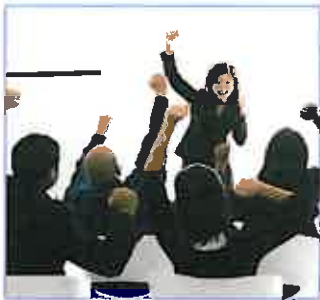
Get involved with an organization that will address your specific needs!

During the 66 year history of IAAP, office professionals have recognized the value of membership in an organization that addresses their specific needs in the areas of: