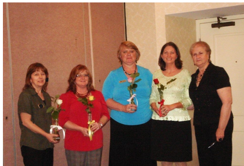
Installation of officers at June's Membership Meeting