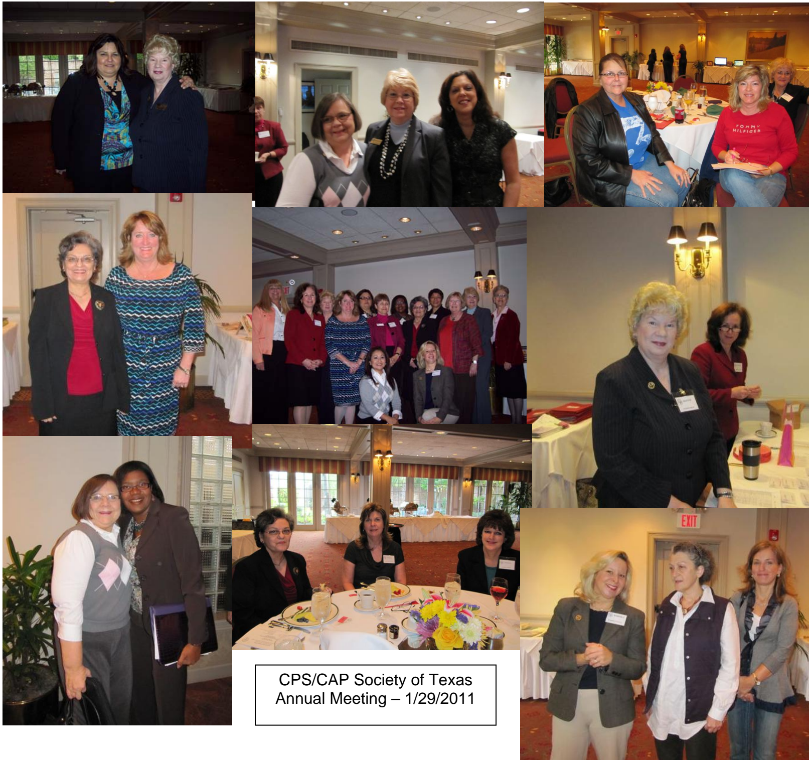
CPS/CAP Society of Texas Annual Meeting – 1/29/2011