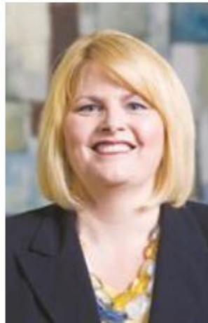
Tamra Goodall, CAP/CAP-OM IAAP International President

Visit the International website at: http://community.iaap-hq.org