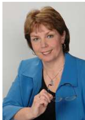
Barb Horton CAP IAAP International President

Theme for 2008 and 2009 as announced by the International Board at the International Meeting in New Orleans, Louisiana.