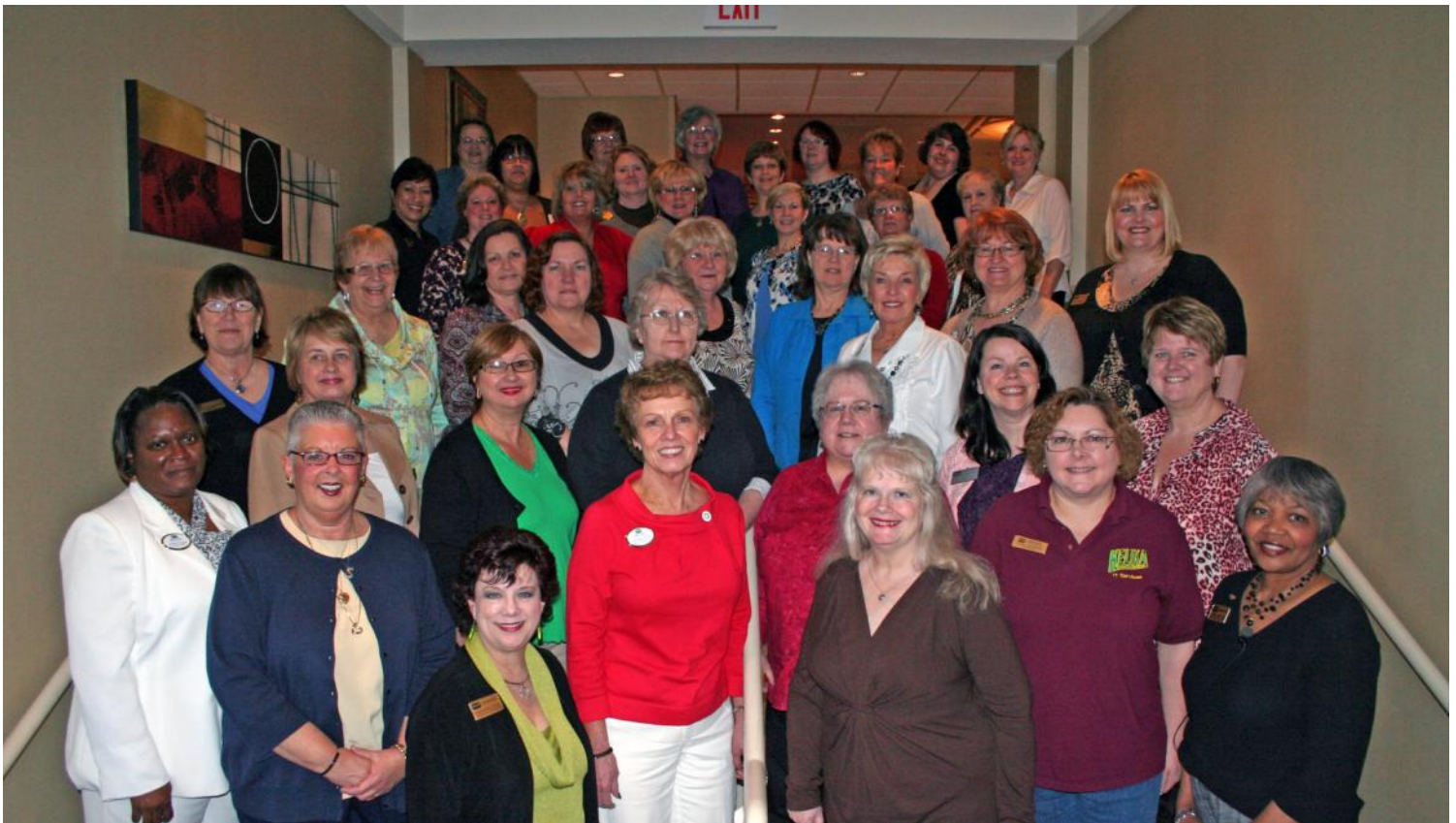
2011-2012 Incoming Division President's Conference in Kansas City