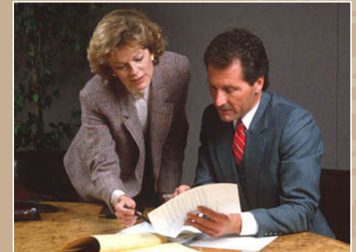
Executive Assistants & Office Managers

Free subscription to OfficePro ® magazine