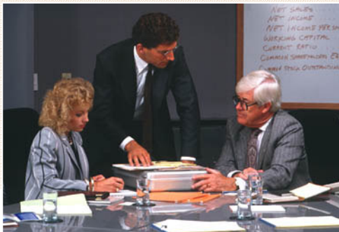
Executive Assistants and Office Managers