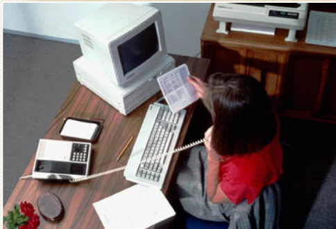
Administrative Assistants and Receptionists