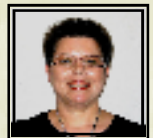
President, IAAP Edmonton Chapter