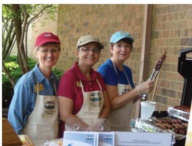
Buehler’s Patio Sale

Be sure to check the IAAP website for free podcasts.