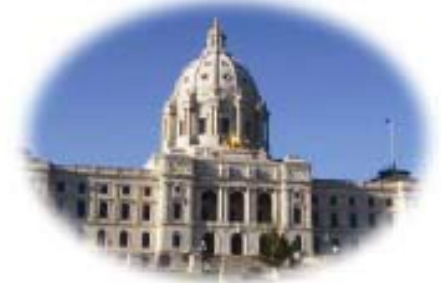
Saint Paul Chapter