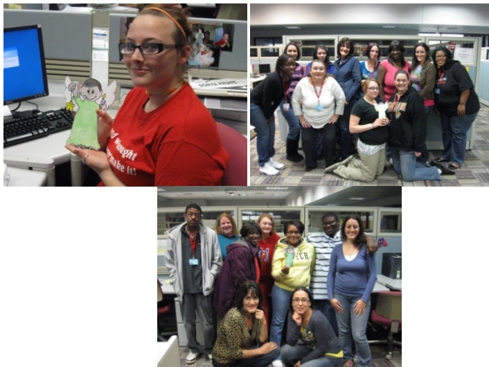
All of our class excited for our Angels!