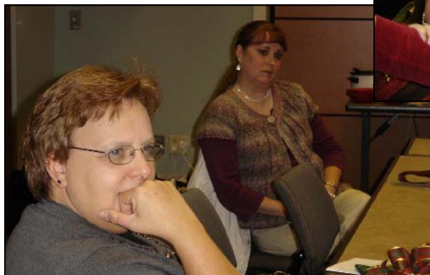
Hard to say which was more fun, Show & Tell or stealing someone else's great gift.