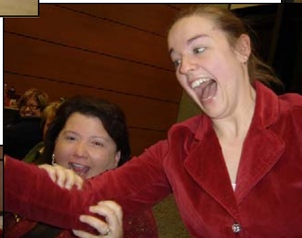
Having fun is easy when the food and company are good!