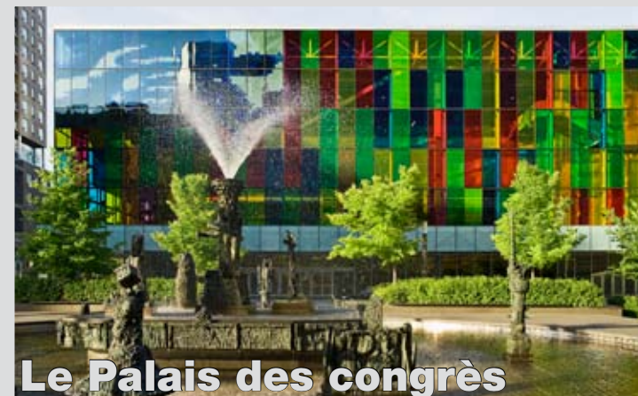
Le Palais des congrès