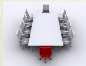
Virtual meetings are the wave of the future. Your Board of Directors has been meeting virtually for several years.

We're hitting the ground running by attending EFAM in Montreal at the end of this month, preparing a budget, planning for the 2012 Annual Meeting, and determining