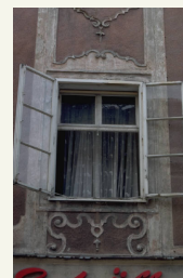
Montreal, Quebec, Canada

Look for detailed information on a Division dinner as it becomes available.