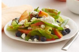
Peaches & Greens Salad