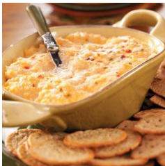
Baked Onion Cheese Dip From Taste of Home

Here are some recipes for your Super Bowl party: