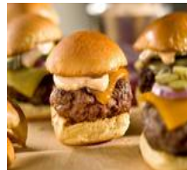
Sliders w/ Chipotle Mayo

Nutrition Facts: 1/4 cup (calculated without crackers) equals 208 calories, 19 g fat (9 g saturated fat), 44 mg cholesterol, 248 mg sodium, 2 g carbohydrate, trace fiber, 7 g protein.