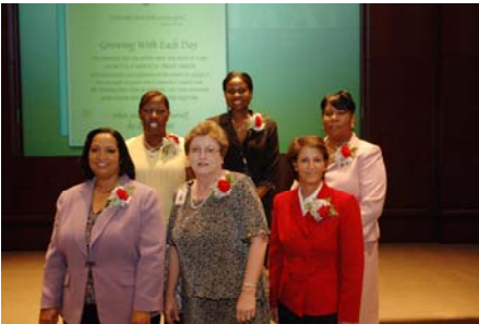
2007/2008 Board Officers