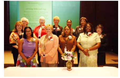
2007/2008 Committee Chairs

It is with Great pleasure that we announce your 2007-2008