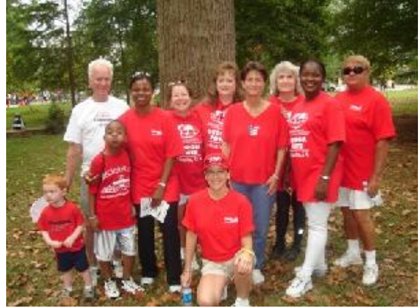
Georgia Power Chapter - IAAP 2005 Walkers

On behalf of the millions of Americans with diabetes and their families and friends, we are counting on you to help our team make a difference! The funds we raise will support the American Diabetes Association's important research, information and advocacy efforts and its mission: to prevent and cure diabetes and to improve the lives of all people affected by diabetes.