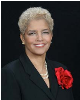
Atlanta Mayor Shirley Franklin