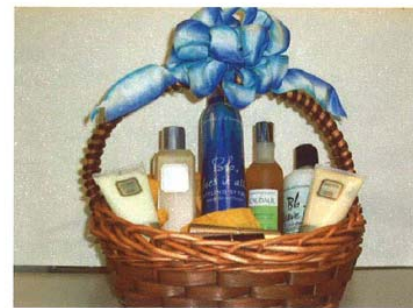
Basket includes products worth up to $200.00, plus Gift Certificate (valued up to $165.00) for a luxurious facial customized for your skin needs...

A great gift to give yourself or someone else for the Holidays!