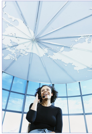
IAAP has members all over the world, even overseas.

Many corporations, educational institutions, students, and international affiliate organizations also belong to IAAP.