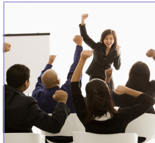
Get involved with an organization that will address your specific needs!

During the history of IAAP, office professionals have recognized the value of membership in an organization that addresses their specific needs in the areas of: