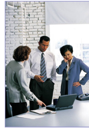
IAAP provides resources to meet needs and challenges facing administrative staff, today and tomorrow.

IAAP can become your partner in leading your administrative professionals toward achieving excellence. We provide resources to meet the needs and challenges facing the administrative staff, today and tomorrow. IAAP members receive the tools and knowledge necessary to become more effective contributors to their employers. By reading IAAP publications and attending IAAP educational events, members stay on top of their profession.