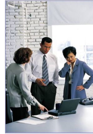
IAAP provides resources to meet needs and challenges facing administrative staff, today and tomorrow.

IAAP can become your partner in leading your administrative professionals toward achieving excellence. We provide resources to meet the needs and challenges facing the administrative staff, today and tomorrow. IAAP members receive the tools and knowledge necessary to become more effective contributors to their employers. By reading IAAP publications and attending IAAP educational events, members stay on top of their profession.