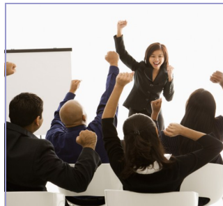
Get involved with an organization that will address your specific needs!

During the 66 year history of IAAP, office professionals have recognized the value of membership in an organization that addresses their specific needs in the areas of: