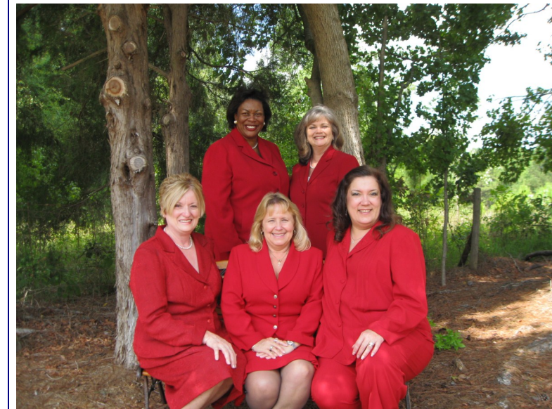
2010-2011 Georgia Division Board of Directors