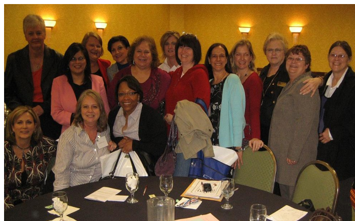
Galveston County Chapter members at the March 6th Seminar!!!!