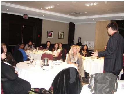
Hanging on to every word, before the “active” part began!