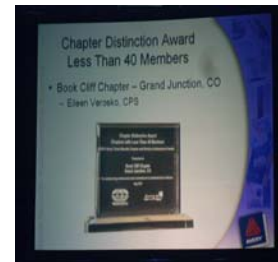
Chapter Distinction Award Less than 40 members went to Book Cliff Chapter.

“Human beings, who are almost unique in having the ability to learn from the experience of others, are also remarkable for their apparent disinclination to do so”