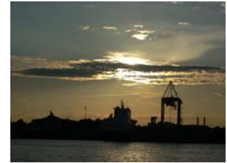
One of Montreal's sun sets.

We have over 2,500 beautiful rooms and suites, 86,664 square feet of casino space, seven outstanding restaurants, a sparkling outdoor swimming pool, a luxurious spa, state-of-the-art health club, full-service beauty salon, a unique variety of retail options and, of course, entertainment. Whether you're traveling on the Las Vegas monorail or their free shuttle that takes you to all the Las Vegas resorts, getting around during your stay is easy! Harrah's Las Vegas is located within minutes of McCarran International Airport.