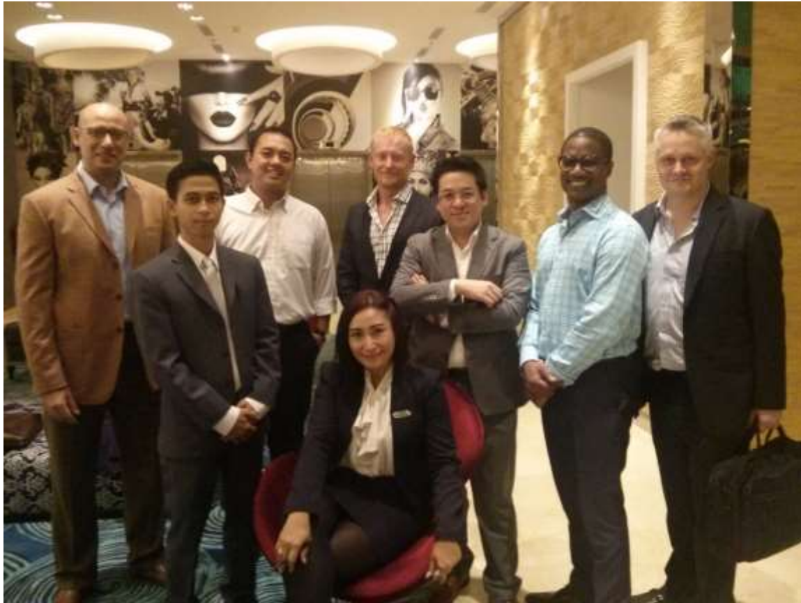
Jakarta Event – Board members