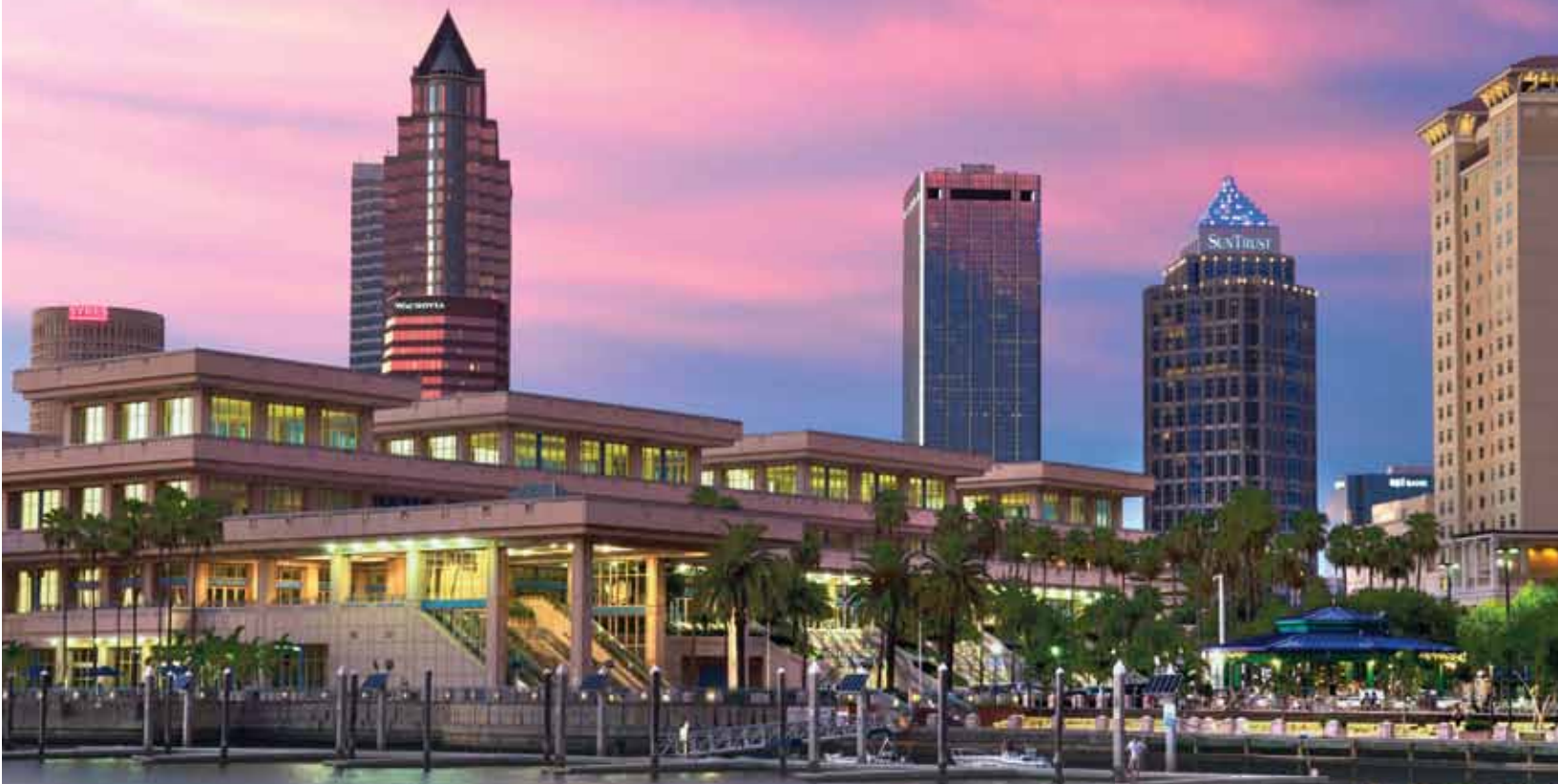
Tampa Convention Center

From national conventions to informal meetings and corporate retreats, Tampa Bay is your place to meet. Meetings in Tampa Bay are made easy with a world-class airport and a walkable, waterfront convention district, first-class accommodations, unique event venues, delectable dining options and more.