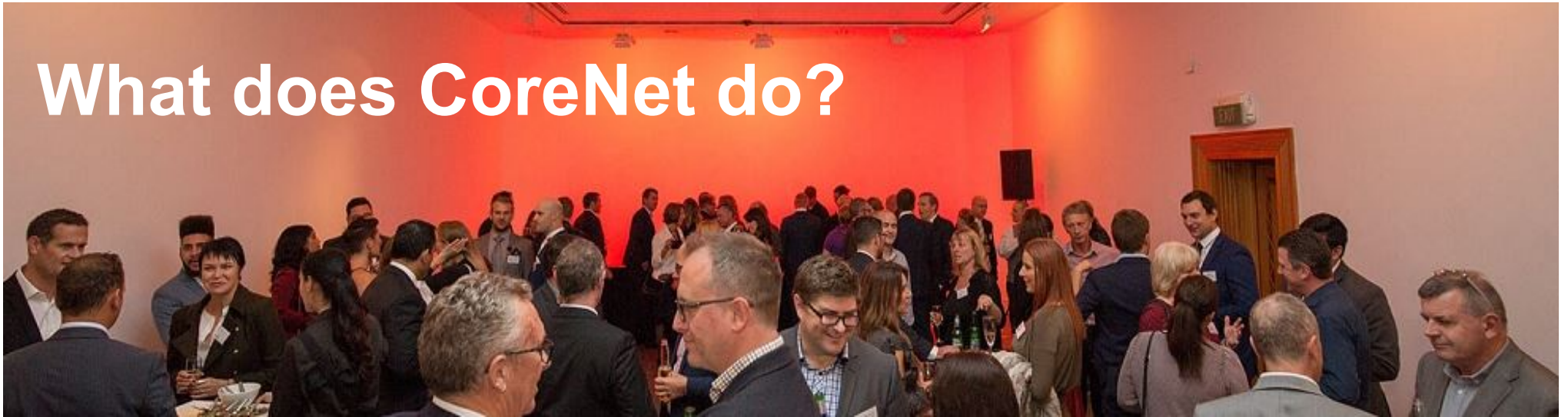
Learning & knowledge events (MCR)